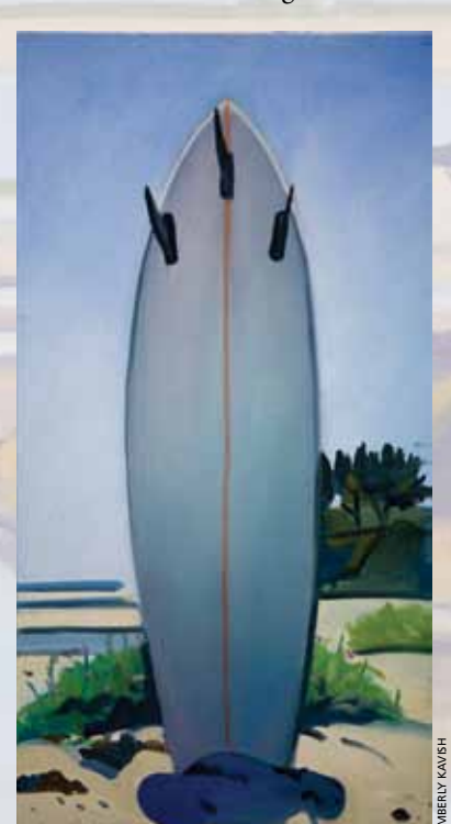
"Lincoln's Board," 2006, oil on canvas, 26 x 16 in.

What is the test of a good painting? "You have to live with a painting, and if the painting, like a poem and like a song, has some sort of integ-