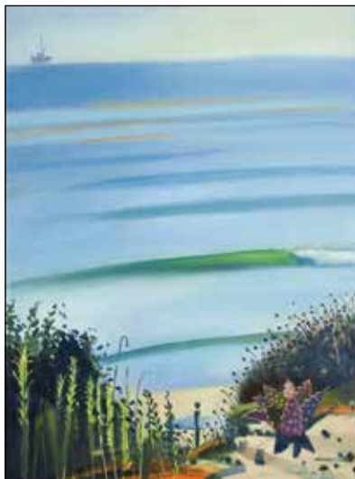
Studio View with Surfer and Platform by Hank Pitcher

“I learn over and over that it is about who we are as much as about where we are – about what we do with what we have,”