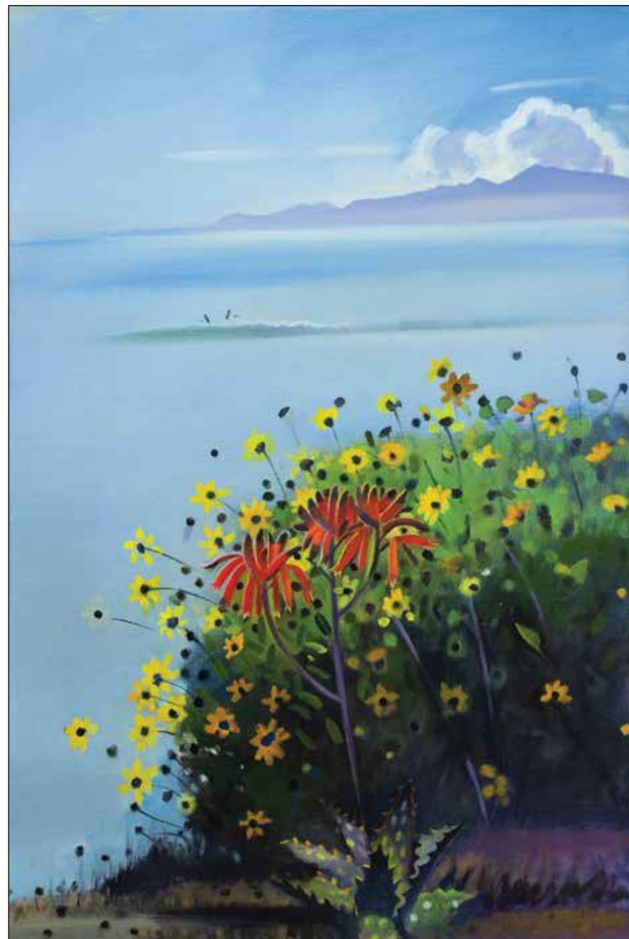
North Point Aloe 1 by Hank Pitcher